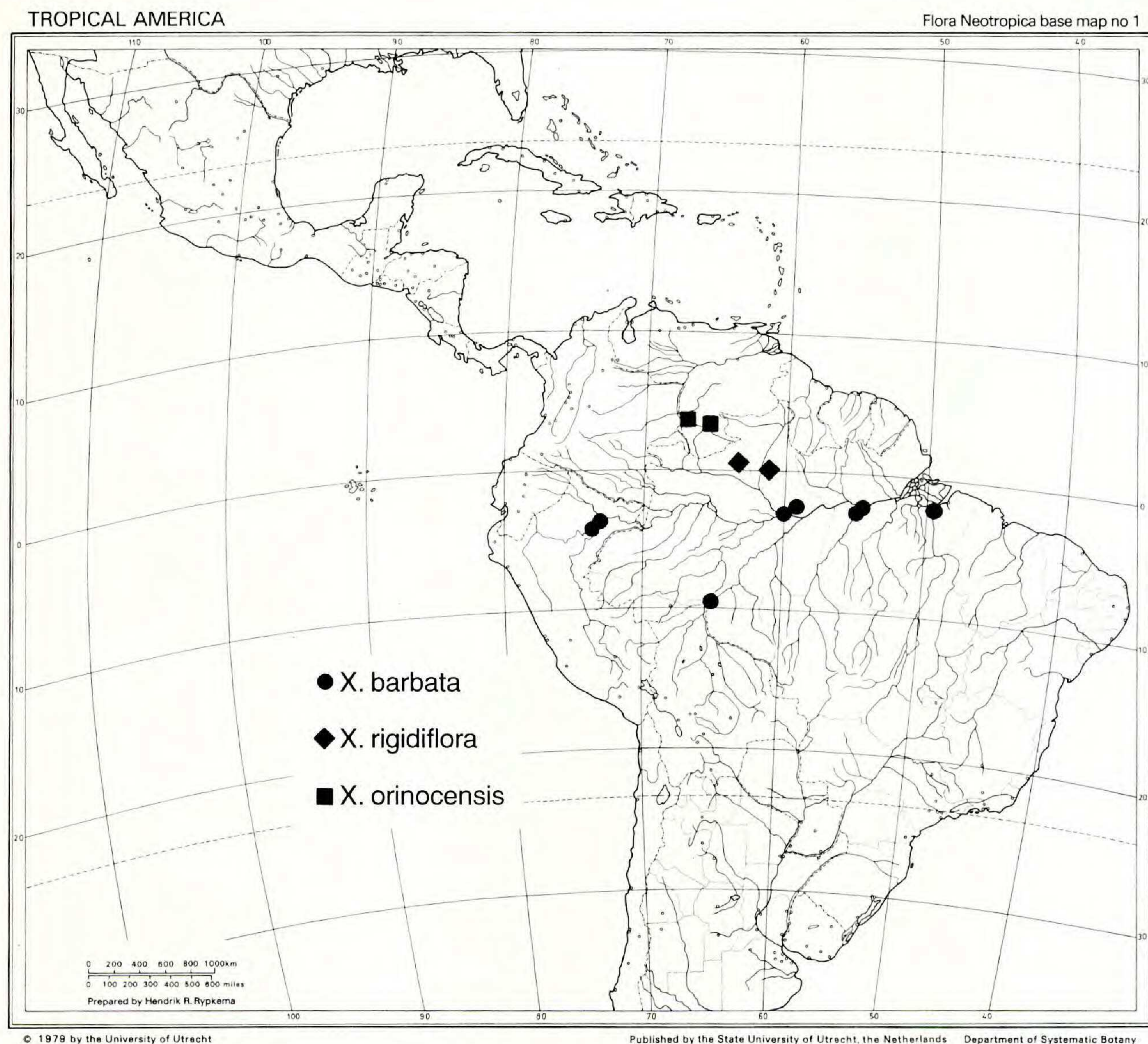
FIG. 2. Distribution of Xylopia barbata , X. rigidiflora , and X. orinocensis in South America.